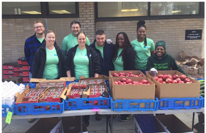
Volunteers from PJM Interconnection Co.

If anyone wants to help, please volunteer by signing up at einsteinfreshforall@einstein.edu .